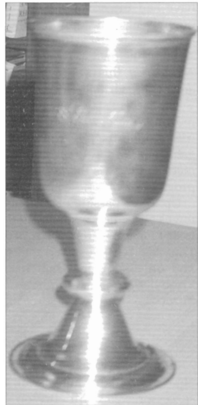
The communion chalice of Dublin silver, dating from 1724, used by the Presbyterian congregation which met at Knockkelly Castle.

While overall membership numbers are not given in annual Presbyterian Returns, Fethard had twenty-seven